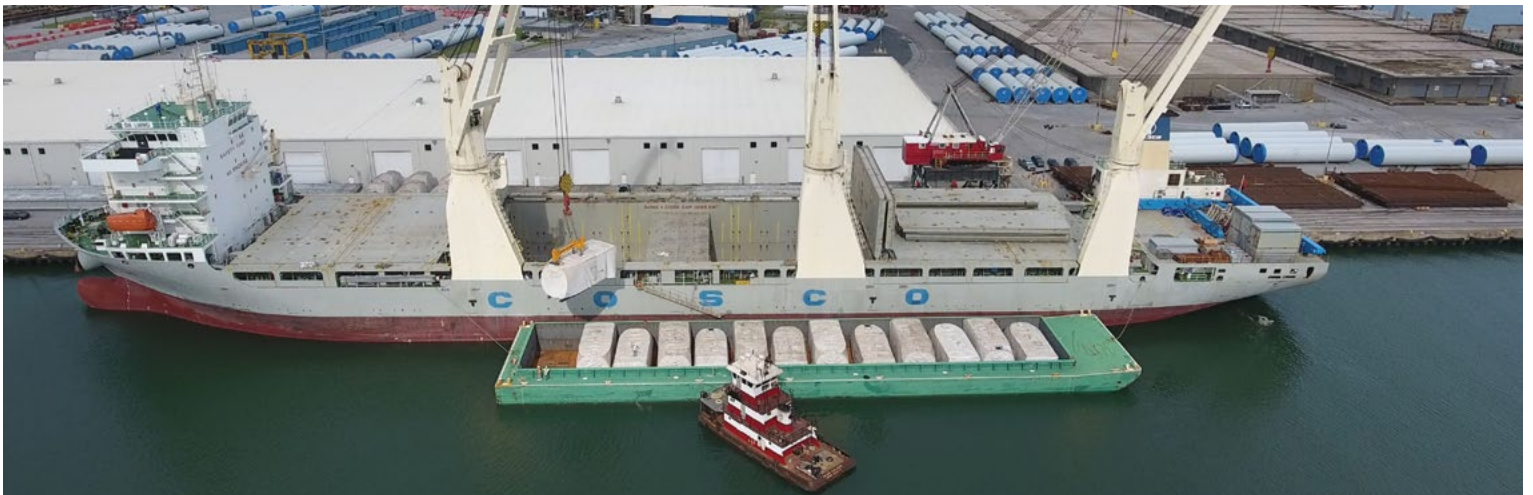
Tug and Barge receiving Wind Turbine Nacelles directly from ship's side in Morehead City NC. Amazon's Desert Wind Project